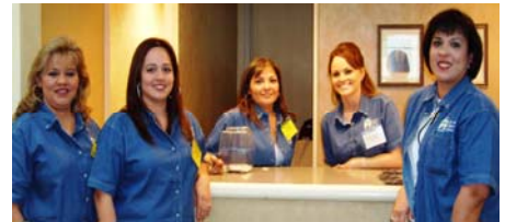
Corpus Christi Municipal Court staff welcome TCCA members at the registration booth

The Texas Court Clerks Association would like to welcome everyone back in October 2009 to Abilene, Texas for the next Annual Conference. Registration forms will be available online next Spring at www.texasclerkclerks.org .