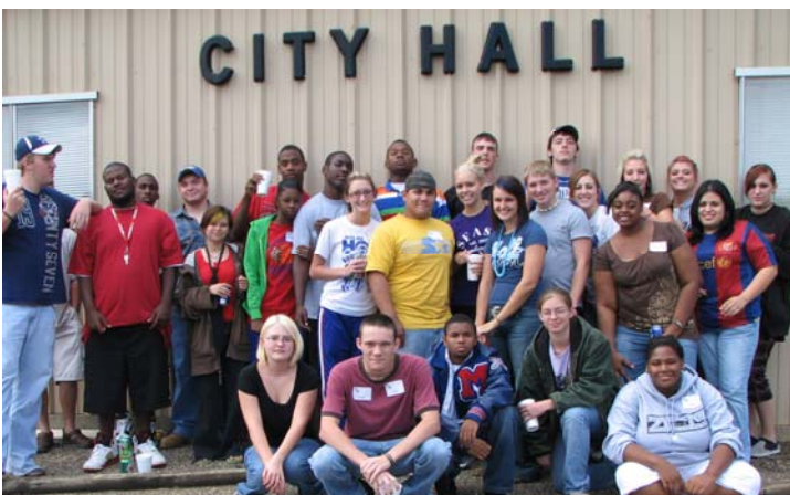
Students from Mount Enterprise Senior Government class convicted Mr. Potato Head of speeding in a mock trial

As you can see, there are many ways to celebrate the week, educate the public, make future career choices for the next generation, and make the court process less evasive by helping the public to simply understand. To court staff everywhere, THANK YOU for all you do, to the judges and prosecutors, THANK YOU for your guidance and participation. Please budget time for this amazing week every year...you never know who you will touch or whose life you will change.