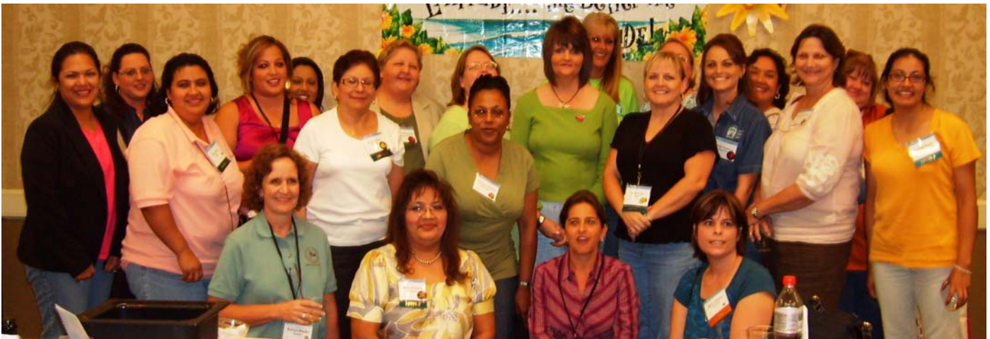
TCCA Members, pictured above, attended the TCCA Annual Conference for the first time. TCCA Board Members welcomed the new attendees at the First Timer's Orientation on Sunday.