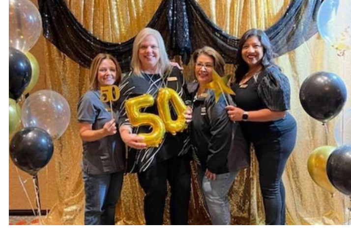
FOR YOUR SUPPORT OF THE TCCA CONFERENCE